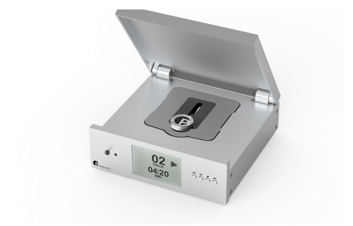
best CD transport we possibly could.

Transport-only matters, because many already have a very good DAC, which means we do not have to add a DAC and drive costs up. So we concentrated to make the