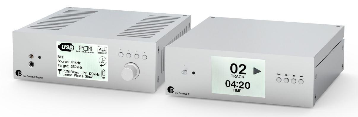
I^2S + Masterclock Output via HDMI make Pre Box RS2 Digital and CD Box RS2 T the perfect combination