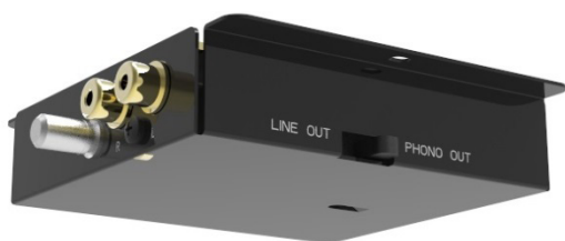
Built-in phono stage Switchable phono/line output

The T1 from Pro-Ject Audio Systems is the first T-Line turntable, aiming to deliver true high-fidelity sound on a limited budget. Boasting premium materials, stylish aesthetics and a rich, lively sound, the extensive development process has ensured that there has been no compromise in the sound performance when achieving such an affordable price. Compared to the base T1-model, the Phono SB version includes a built-in, Pro-Ject designed, high-quality phono MM stage and an electronic speed switch between 33 and 45 RPM.