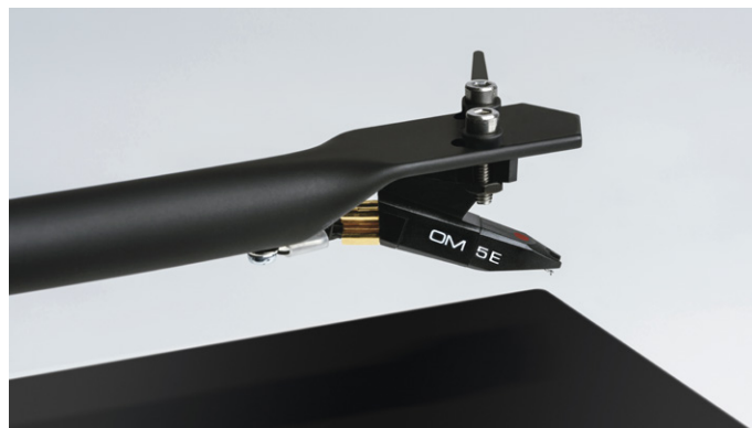
High-quality Ortofon OM5e Moving Magnet cartridge with elliptical stylus tip

The tonearm on the T1-line is a new model, based on previous Pro-Ject designs. With its straight, 8.6" effective length and stiff aluminium construction, this one-piece tonearm also features low-friction bearings for absolute accuracy in use. Besides the clean and stylish looks, the integrated headshell won't cause any additional vibrations either, and is a big improvement over other detachable, screwed-on or glued-on headshells!