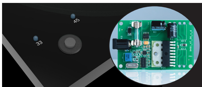
Electronic Speed Switch between 33/45 RPM DC/AC motor control board for best speed stability

For the drive system, where most alternative products may use un-regulated DC motors with wide speed fluctuations, the T1 Phono SB features our proven system of an electronically regulated, precision-speed AC motor. The T1 Phono SB also comes with electronic speed switching between 33 and 45 RPM. The result is a low-noise, stable drive system for the turntable.