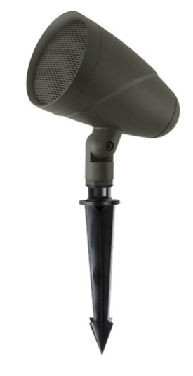
Ground stake sold separately